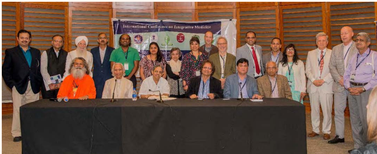
Speakers and Organisers of the 3rd International Conference on Integrative Medicine at Harvard Medical School, Boston